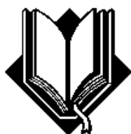
PART II GAMES AND PROTEST PROCEDURES, Protest Procedures